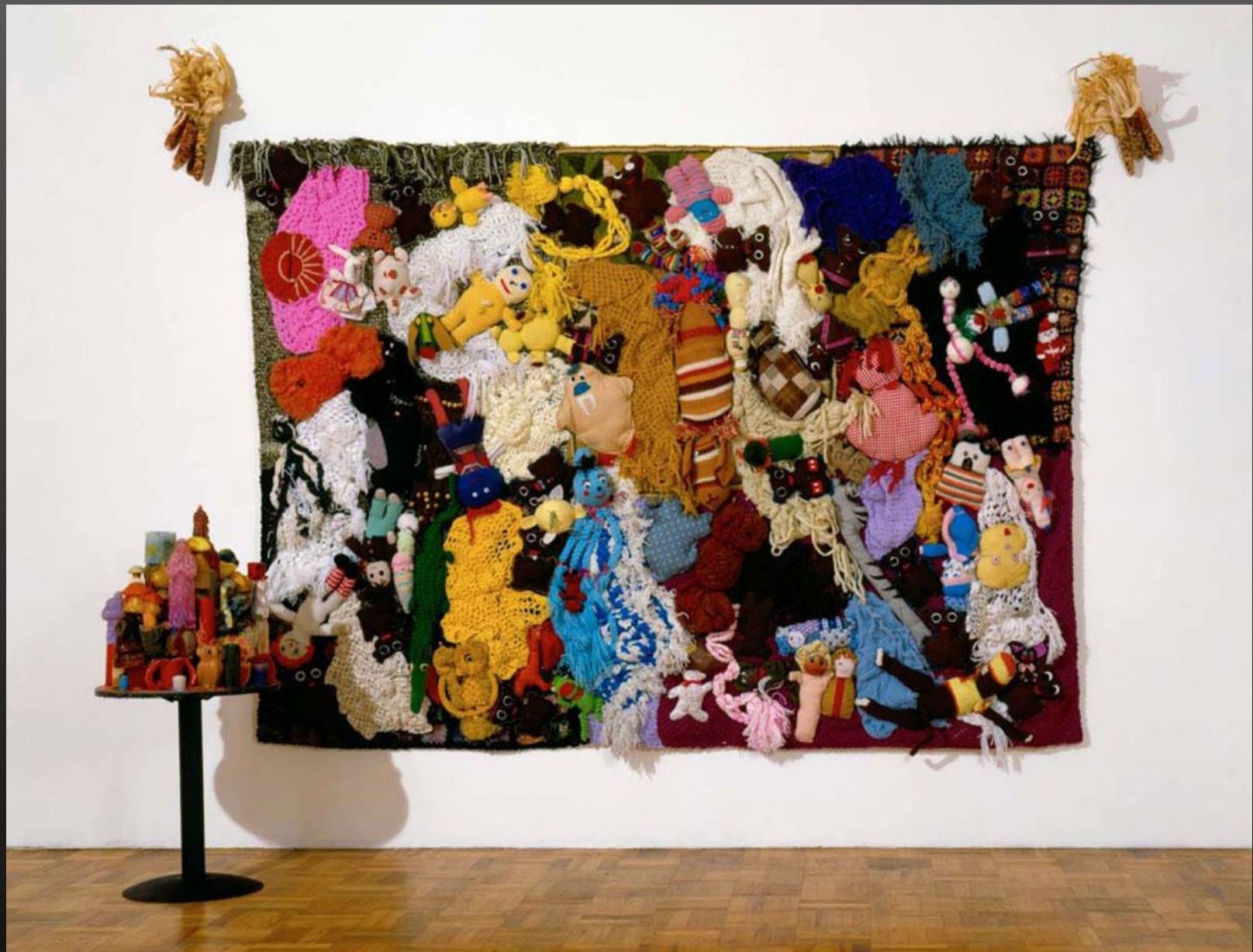
“More Love Hours Than Can Ever Be Repaid and The Wages of Sin” Mike Kelley, 1987.

“death strikes me as an important issue relative to postmodernism.”